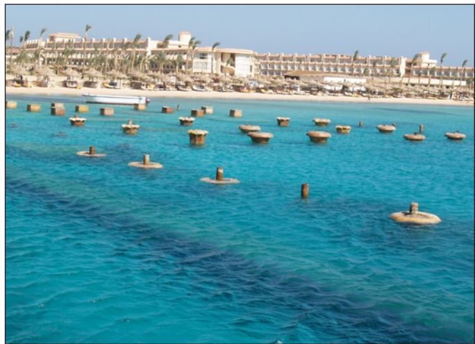
Resorts line Egypt's Red Sea coastline in Sahl Hasheesh Phases I & II

Founded in 1993, HCG is committed to designing sustainable projects that meet community needs, produce balanced growth, are financially feasible for their clients and create positive economic value for their community. HCG is experienced with the nationally known rating system LEED developed by the U.S. Green Building Council, as well as green design standards recognized by the National Green Building Program, Florida Green Building Coalition and Audubon International.